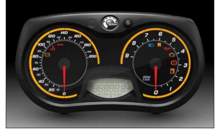
Analog gauge with display