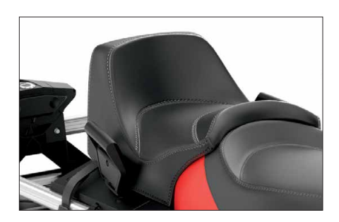
Utility 2-up seat with passenger handholds 2-up seat with integrated back support, including handholds.